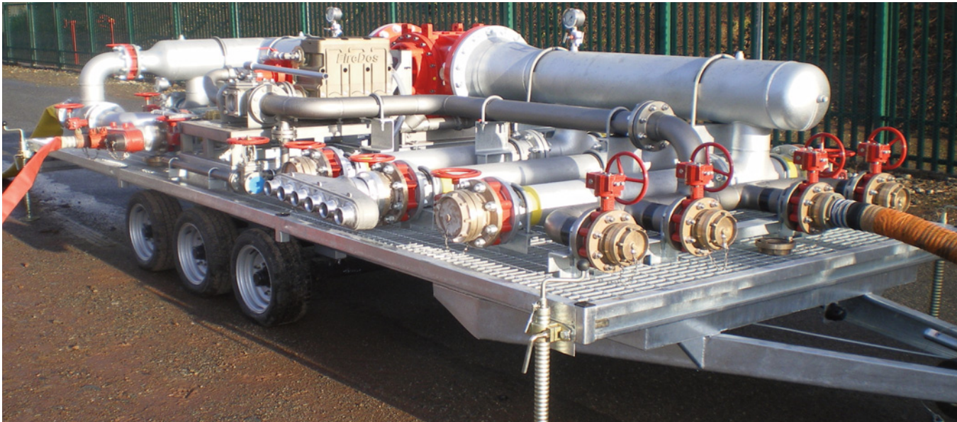
Figure 4. Twin inline foam mixers with multiple outlets

Our dedicated spares department can supply parts or complete items for all the mobile foam equipment components such as pumps, proportioners, inductors and instrumentation etc. spares@knowsleysk.co.uk