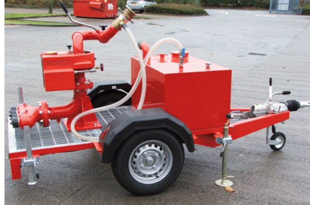
Figure 3. Oscillation monitor with self inducing nozzle

The KnowsleySK Fyrextra Mobile Foam Trailers are specifically designed to give optimum flexibility to the operator. Trailers can be self contained units with foam storage tank, pump/proportioner/inductor, simply requiring connection to the fire main usually via a hydrant. Larger schemes may require separate foam stocks which can also be mobile in the form of a "foam pod" housing several intermediate bulk containers (IBCs). Trailers can be designed to interconnect with fixed systems eg supply foam to Rimseal pourers, or can be fitted with delivery devices such as oscillating, fixed deck, or remote control monitors to deliver foam precisely where it is required.