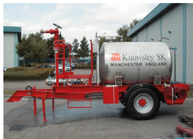
Figure 2. Trailer mounted foam monitor with onboard storage and proportioning

Foam Solution pipework: Hot dipped galvanised carbon steel or to suit site conditions / environment.