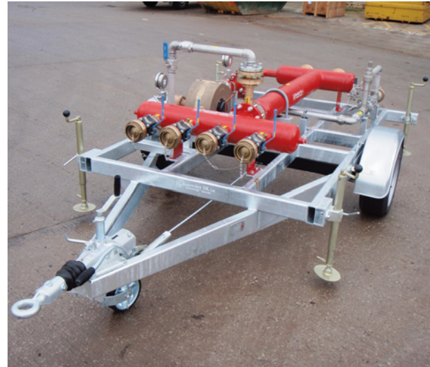
Figure 1. Pelton driven foam pump and balanced pressure proportioner